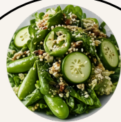
Green Bliss (VG) $7

Tender greens & spinach with seasonal berries, candied pecans, goat cheese, and berry vinaigrette