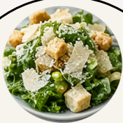
Baby Kale Caesar $7

Crisp romaine & baby kale, shaved parmesan, roasted garlic, Caesar dressing, croutons, lemon wedge